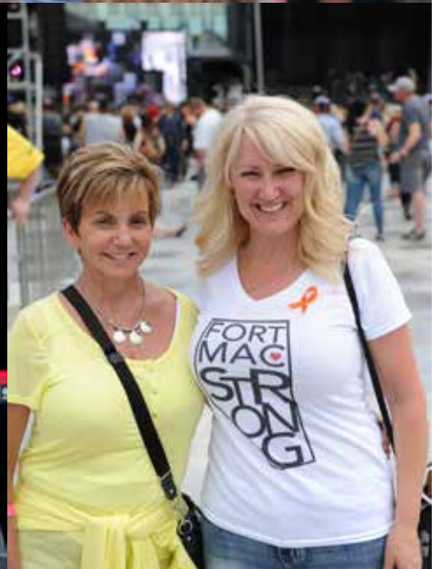
Fire Aid Concert